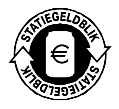
Ministerie van Infrastructuur en Waterstaat

Individual responsibility can be fulfilled collectively. This is done by the Waste Fund. Statiegeld Nederland is engaged in the execution of deposits.